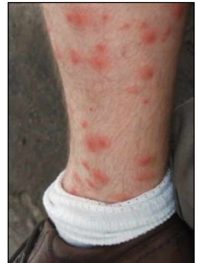
Reaction to bites from chigger larvae.

Chiggers prefer to bite skin where clothing fits tightly, such as around waistlines, sock lines, and behind the knees. Skin begins to itch approximately 1-3 hours after being bitten by chigger larvae. The skin will eventually develop itchy, red or puss-filled bumps at the site of attachment which can be extremely irritating. The itching persists for up to a week and complete healing of the skin lesions can take up to 2 weeks.