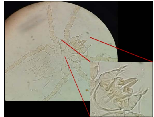
A magnified image of a chigger larva, with a close-up of the claws and blade-like chelicerae.

Chiggers are the larval stage of a mite in the family Trombiculidae. The chigger mite has a lifecycle similar to a tick. Adult females lay eggs, which hatch into six-legged larvae. These 6-legged larvae are the only life stage that feeds on humans. The larvae develop into 8-legged nymphs and then into adults after feeding. Chigger larvae are extremely small (1/100 to 1/120 inch) and will appear red, orange, or yellow through a magnifying glass. The larvae are active from early spring through late fall. Chigger nymphs and adults do not bite humans; they feed on small, soil-dwelling insects and insect eggs. Adult chigger mites are figure-eight shaped and covered in dense red, yellow, or orange hairs. Adults are active in the fall, overwinter in the soil, and lay eggs early in the spring.